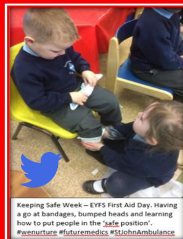
Keeping Safe Week – EYFS First Aid Day. Having a go at bandages, bumped heads and learning how to put people in the 'safe position'. #wenurture #futuremedics #StJohnAmbulance

We are now taking bookings for Kids Club Half Term Holiday Club. Booking forms and a copy of the programme are now available to view and download from the school website!